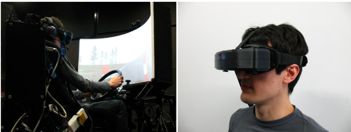
Figure 2. (a) The projection screen mounted to the CyberMotion Simulator; (b) the Sensics xSight HMD. The optics for both eyes can be moved sidewise to match the user's anatomy.

A force feedback steering wheel was used as input device for closed-loop control of the virtual vehicle. As visualization devices, we used a projection screen mounted in front of the seat with a horizontal FoV of 90^\circ and a vertical FoV of 45^\circ . A video projector displayed an image of 1152 \times 450 pixels on a curved screen at a distance of approximately 73 cm in front of the subject's eyes (Figure 2a). For comparison, we used a Sensics xSight 6123 HMD (Sensics Inc., 2010) with a horizontal FoV of 118^\circ and a vertical FoV of 45^\circ (Figure 2b). The low weight of 400 grams limits neck strain and therefore makes it particularly suitable for use on a motion simulator. Each eye piece is rotated outwards off the viewing direction by 16.75^\circ and consists of six individual OLED micro displays. Special lenses are used to overlap all six displays to one seamless image of 1920 \times 1200 pixels in each eye. Given a binocular overlap of 53^\circ , the resolution of both eyes combined is 2664 \times 1200 pixels. Since no head tracking was used, a similar transport delay for both visual systems can be assumed.