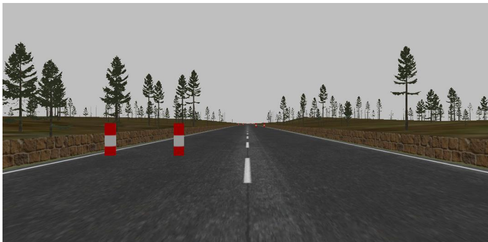
Figure 3: Screenshot of the environment as displayed on the screen in the 90° FoV condition.

The visual environment was modeled using the 3D rendering engine OGRE and consisted of a straight road in a forest setting. Trees of different size were placed randomly alongside the road and were repositioned throughout the experiment. A stone wall flanked the textured road to provide a richer visual feedback (Figure 3).